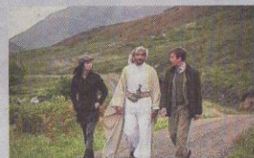
DVD: Salmon Fishing in the Yemen